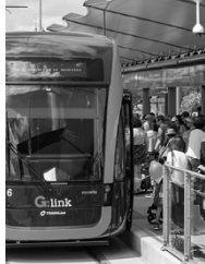
Last year's winner: Gold Coast Light Rail

Recognises exceptional advice and/or innovation in the financing or structuring of a major infrastructure project.