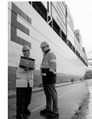
Last year's winner: NCOS Online

Recognises excellence in the delivery of services or management of operations of a major infrastructure asset.