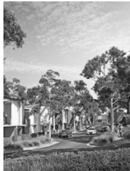
Last year's winner: BaptistCare