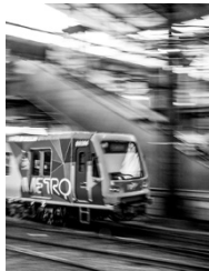
Last year's winner: Metro Trains Melbourne

Recognises exceptional work completed by a contractor including achievement of time, safety and quality objectives.