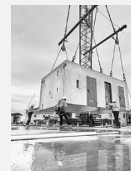
Last year's winner: Ravenhall Prison Project